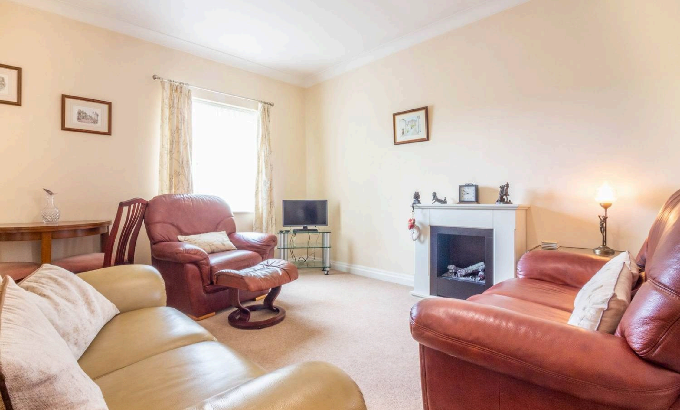
1 Riverdale Court, Kendal £230,000