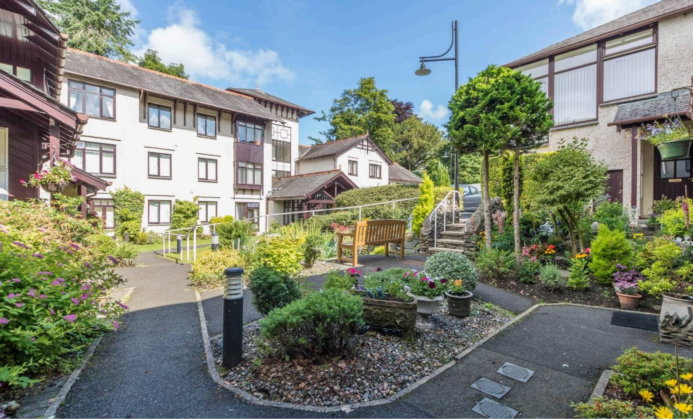
115 Elleray Gardens, Windermere £165,000