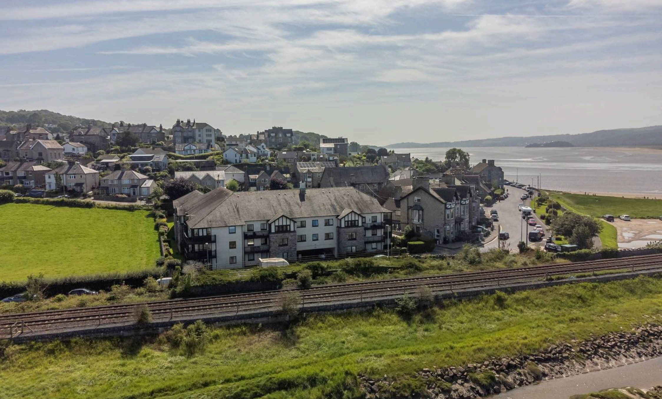
Flat 15, Ashleigh Court Station Road, Arnside £190,000