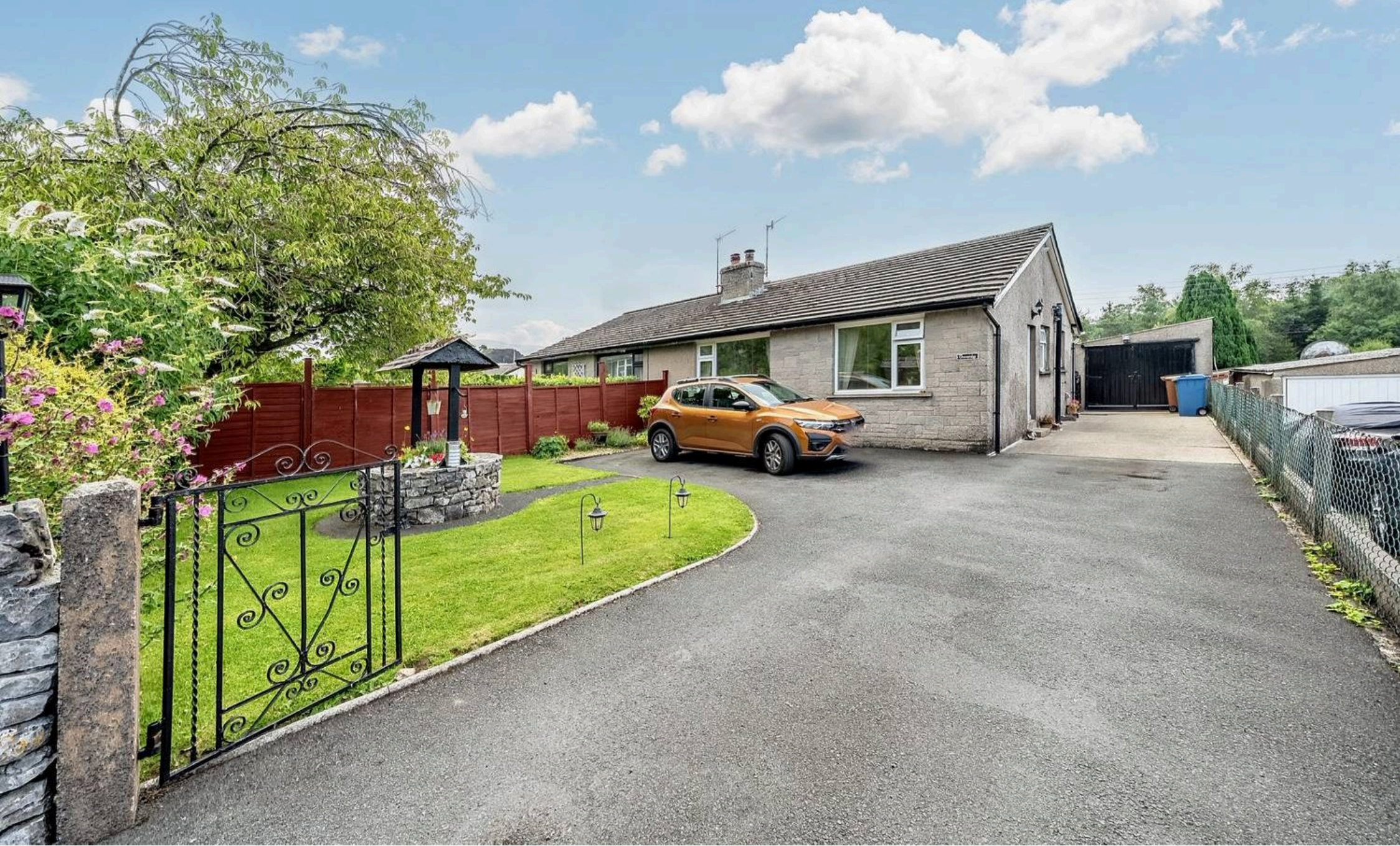
Thornridge, Ingleton £330,000