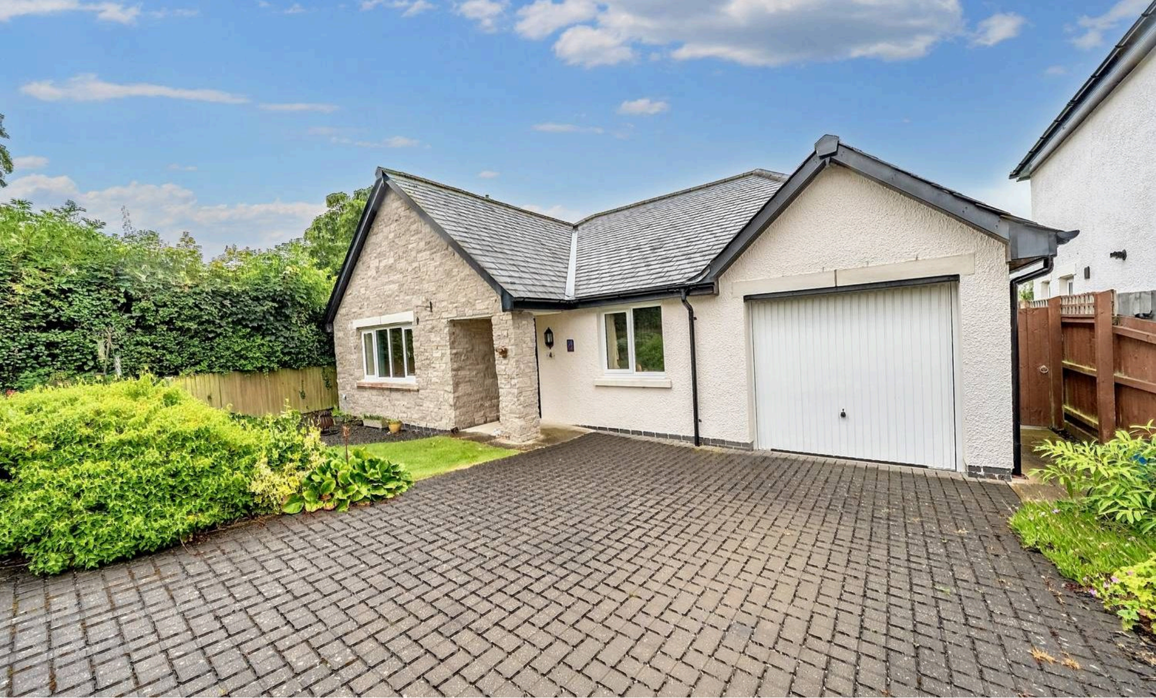
4 Blenkett View Jack Hill, Allithwaite £450,000