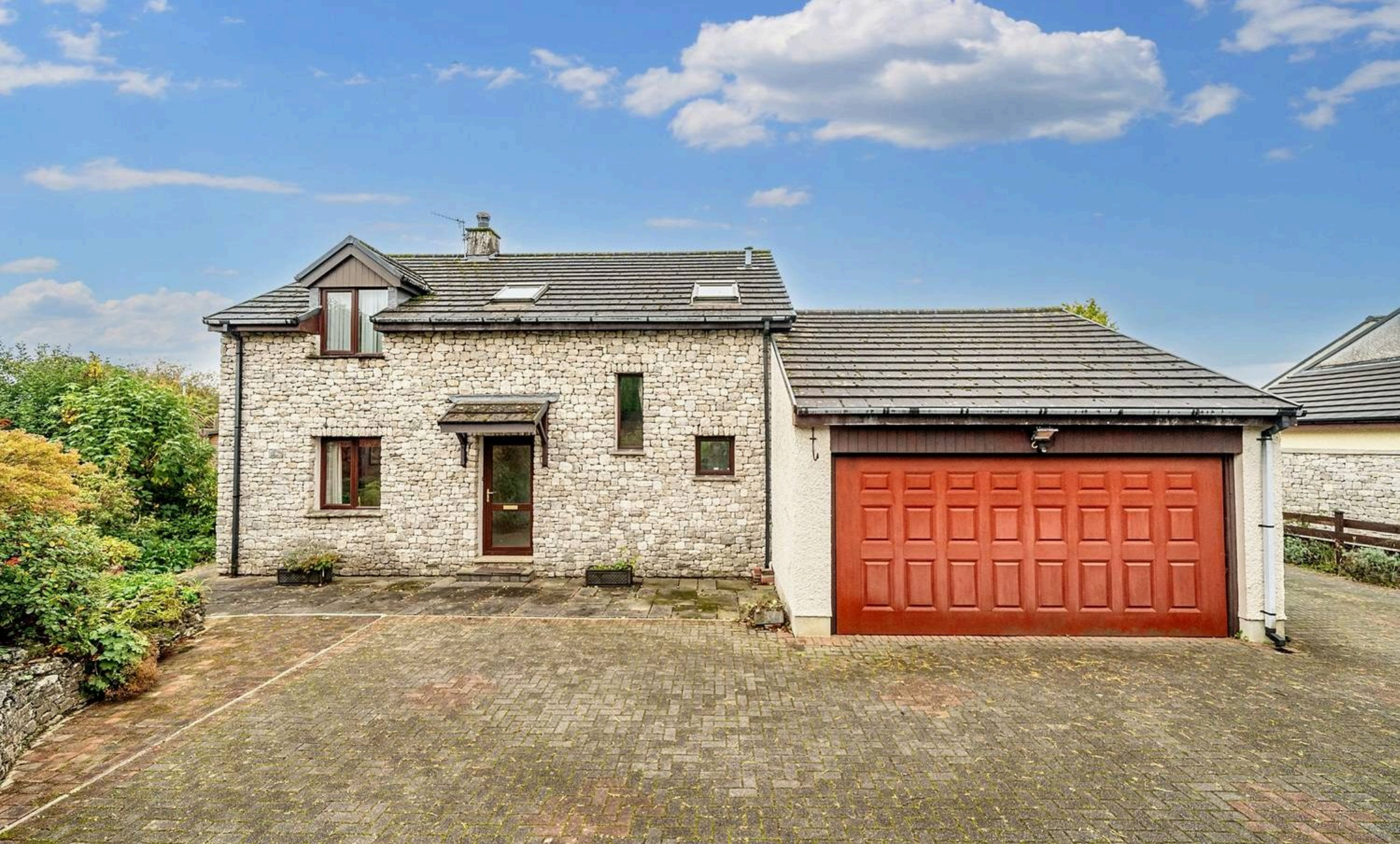
Scar View Murley Moss Lane, Kendal £665,000