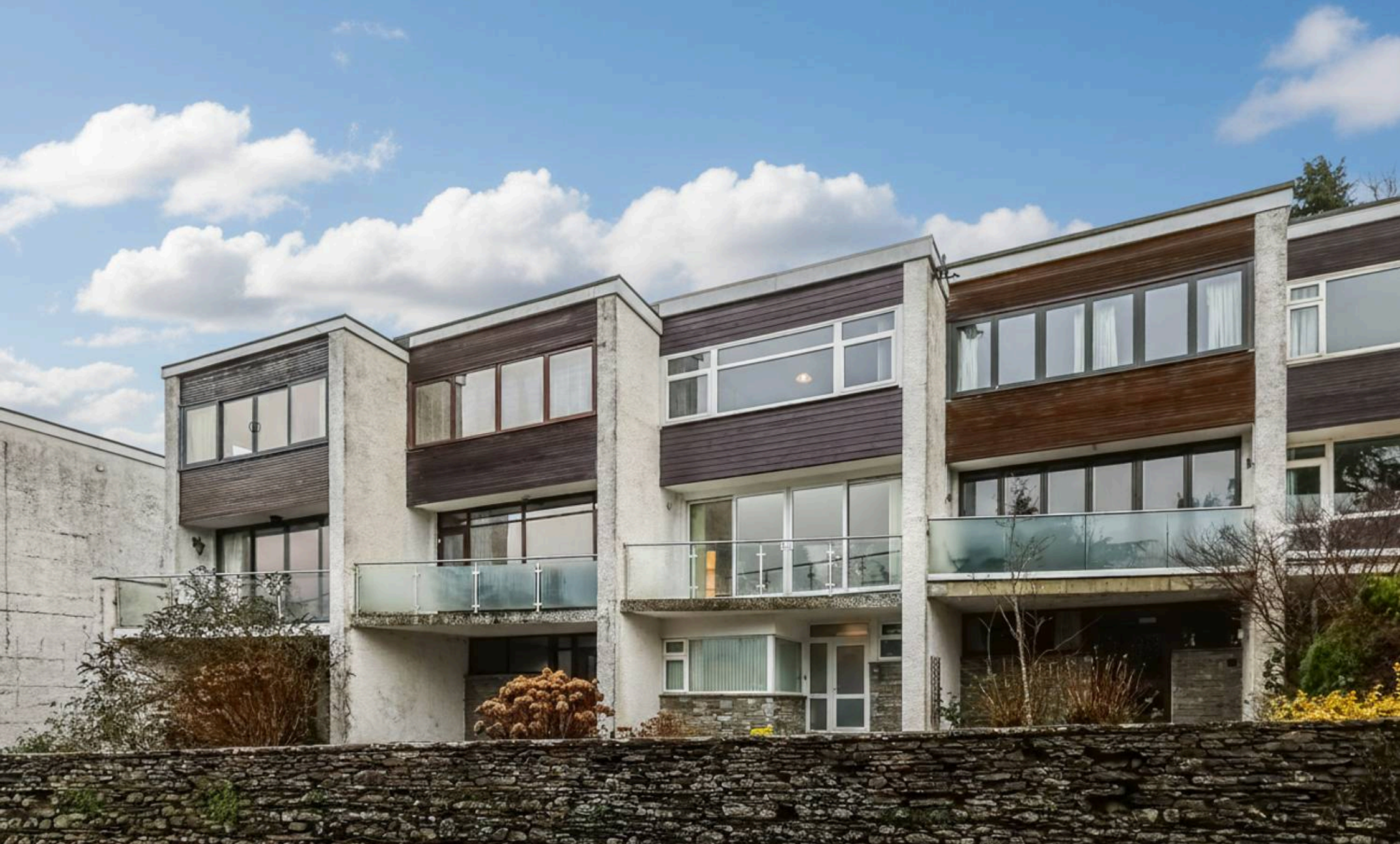
12a Belsfield Court, Bowness-On-Windermere £550,000